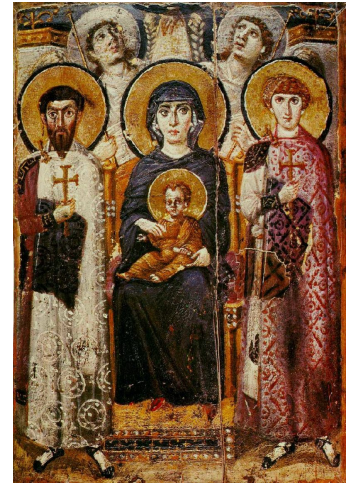
Virgin and Child with angels and Sts. George and Theodore. Encaustic icon on panel, ca. 600 CE, Saint Catherine's Monastery, Egypt

Begin by showing students portraits. These could be photos or contemporary paintings. Discuss the aspects of these images. Show students images of Byzantine Icons. How are these images different than the more contemporary works? Discuss why the portraits are not photo-realistic.